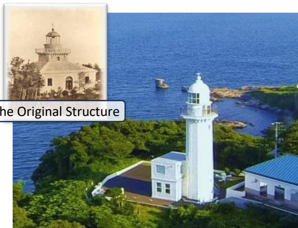
The Original Structure