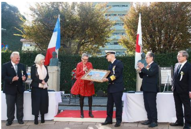
Presentation of the Painting