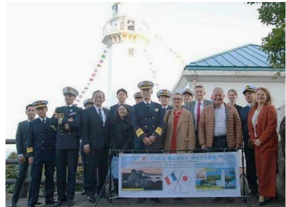
Visit to the Kannonsaki Lighthouse