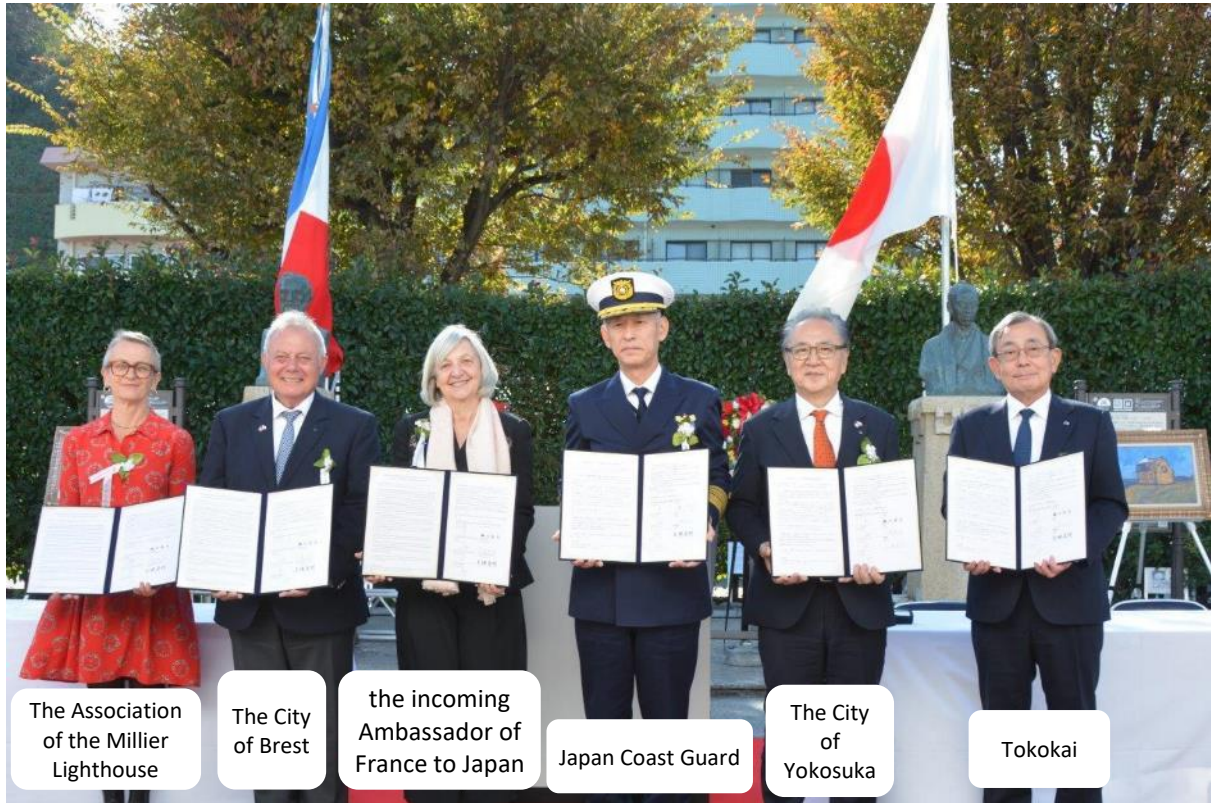
The Association of the Millier Lighthouse